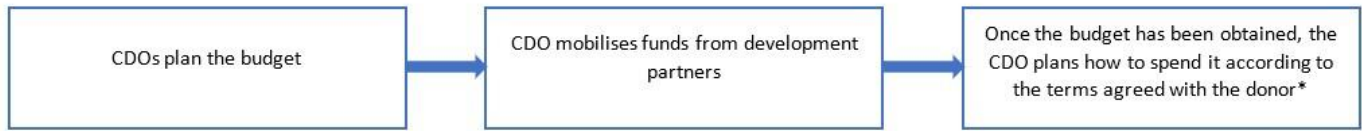
Figure 14: Budget planning procedure for DPs funding

*Either reimbursement against invoice or reimbursement after disbursement, or disbursement directly by the donor to the Ministry.